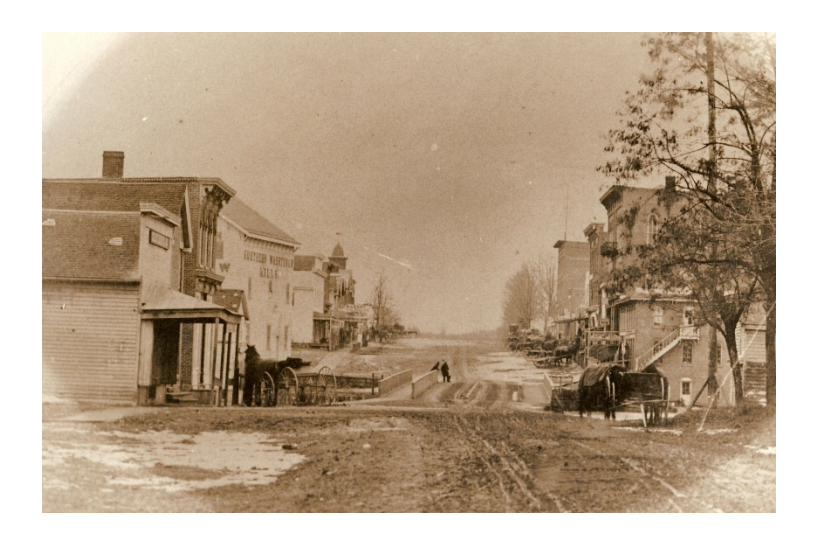
Main Street, Manchester, 1867