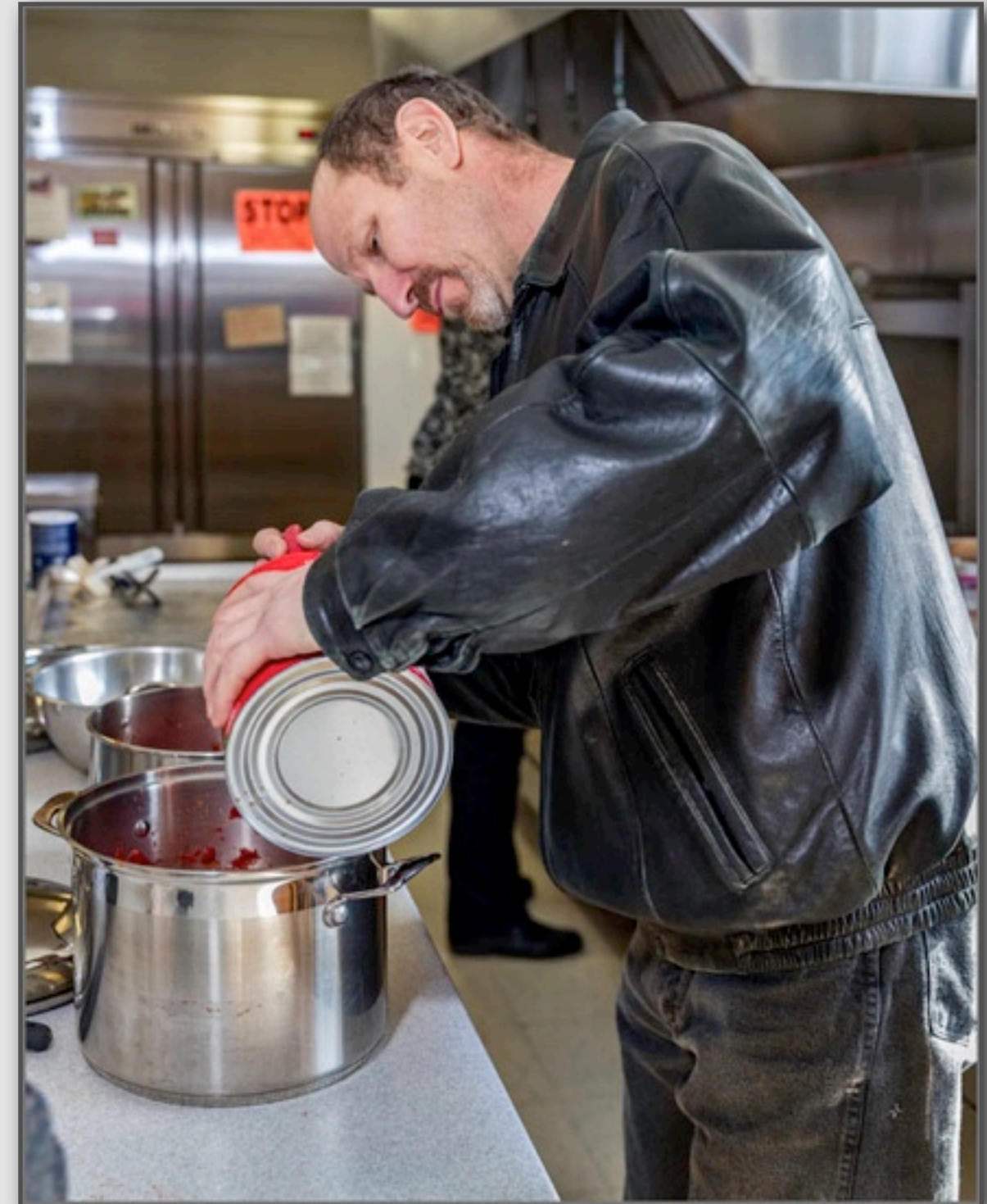
Containers of tomato products are opened and placed into cooking pots.