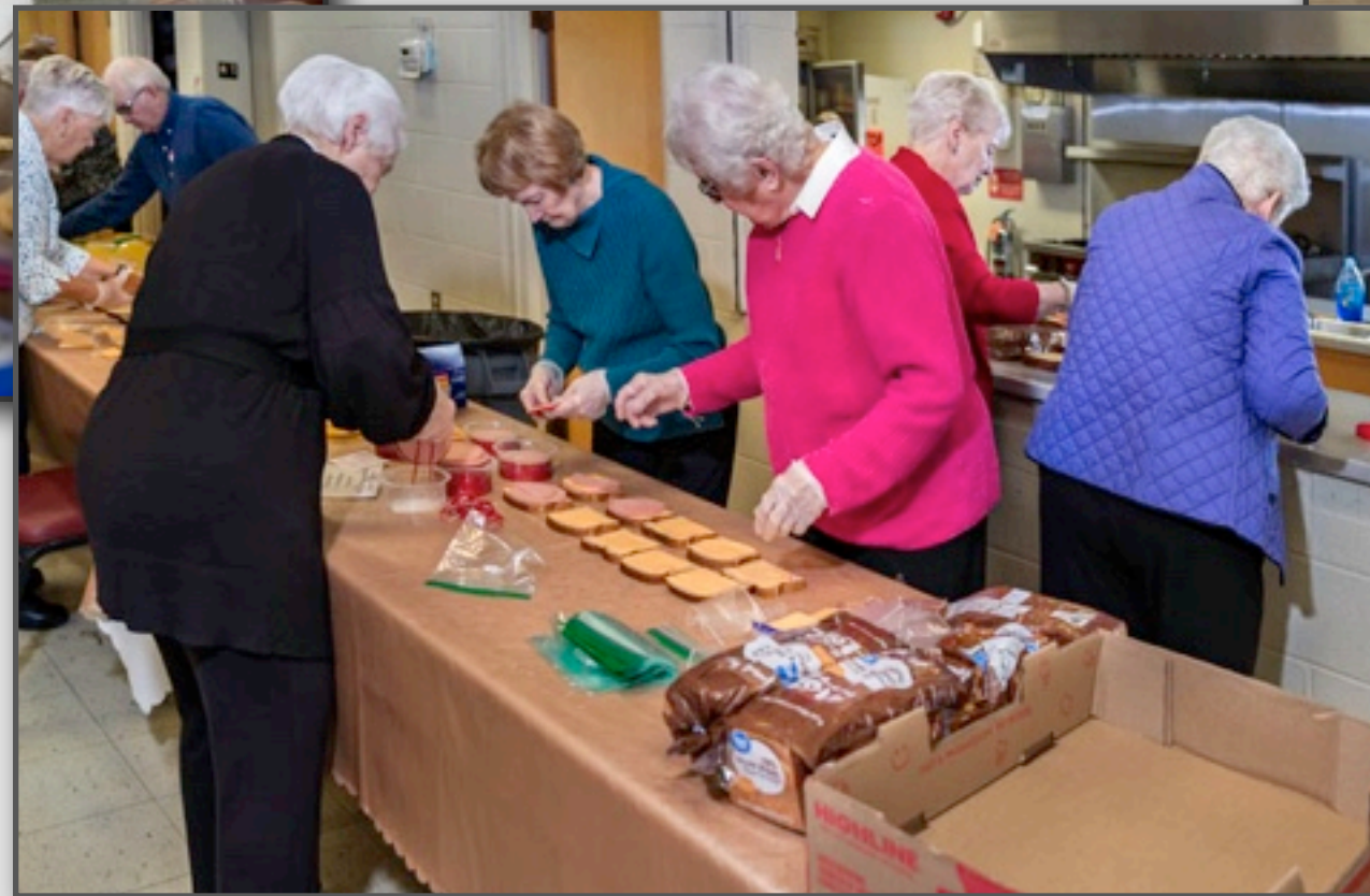
Here are views looking down the sandwich assembly line. (below and right)