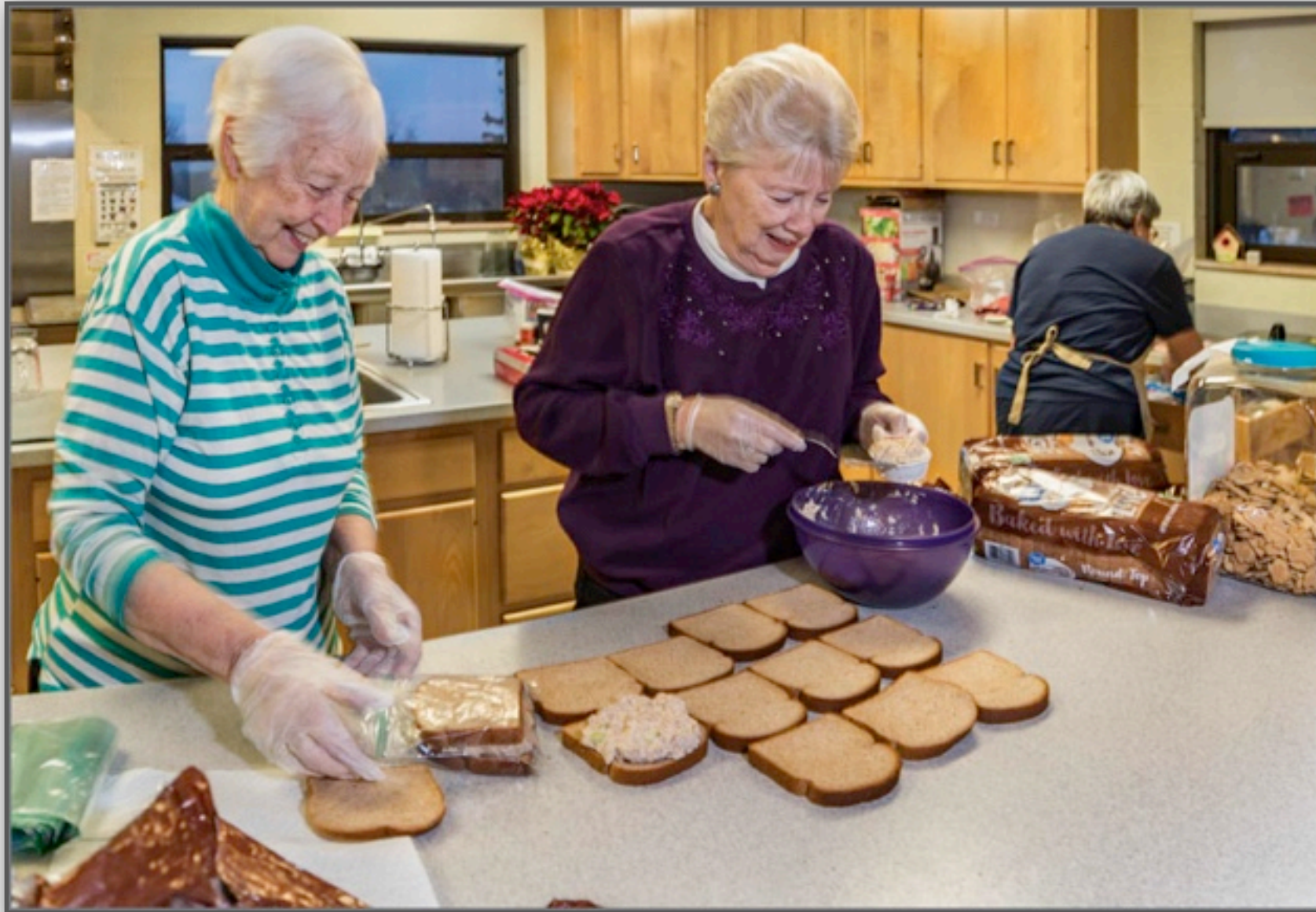
For maximum freshness, tuna salad sandwiches are made at the last moment on Tuesday morning just before all food is delivered to Detroit. (above)