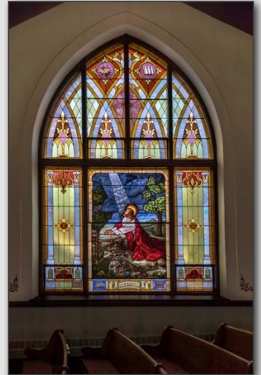
One of several stained glass windows in this early 20th century church.

Sometimes seemingly small actions can have a far reaching effect, much like that of a stone dropped into a still pond. For example, the NOAH Project in Detroit provides food and social services to homeless people and partners with churches, organizations and individuals for assistance. NOAH stands for N etworking O rganization A dvocating for the H omeless. Bethel United Church of Christ is one of about two dozen southeast Michigan churches that support NOAH in its mission of providing lunches to the homeless.