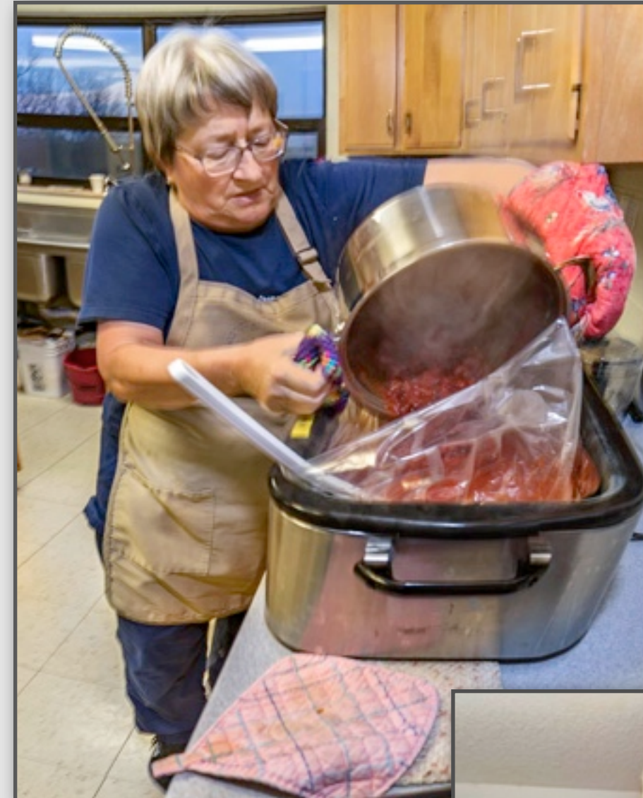
Next, the sauce and meat are combined. (above)