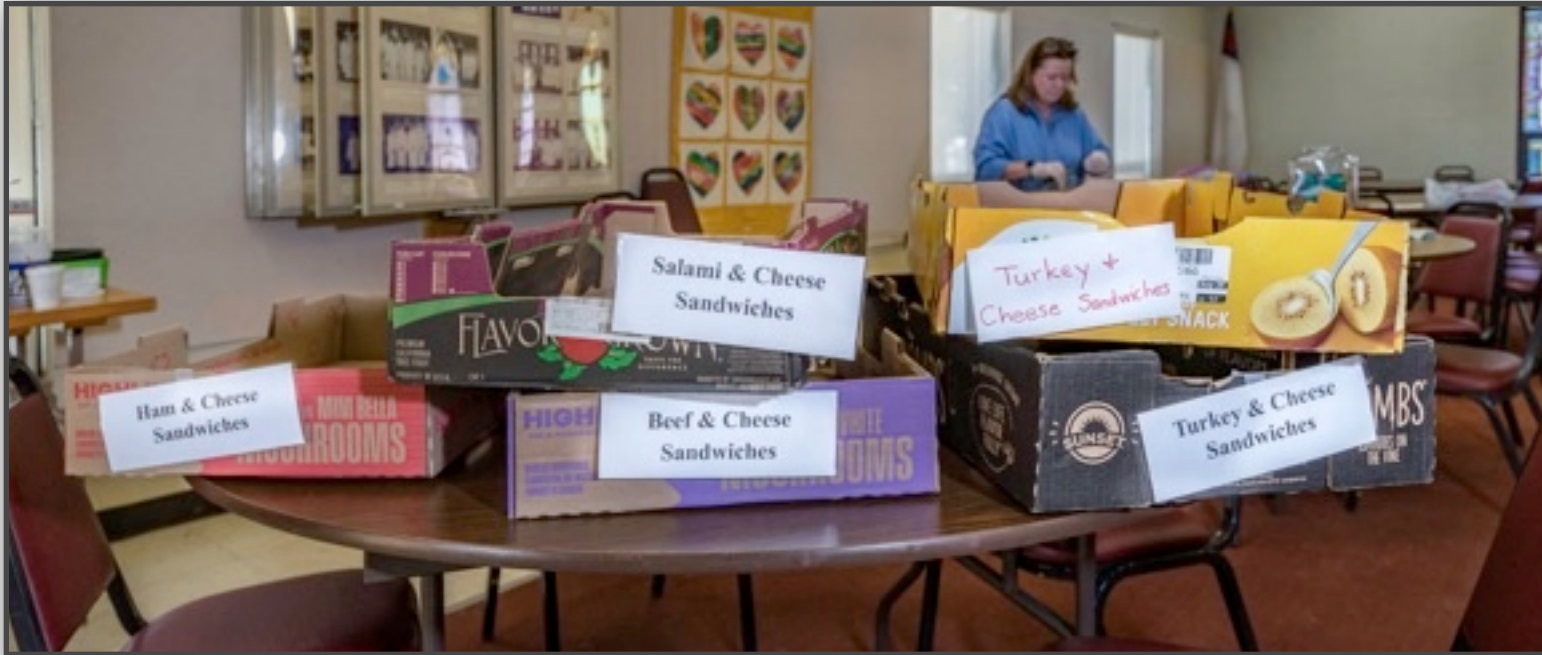
In preparation for Sunday's sandwich preparations, empty boxes are labeled the day before to hold the finished sandwiches for transport.