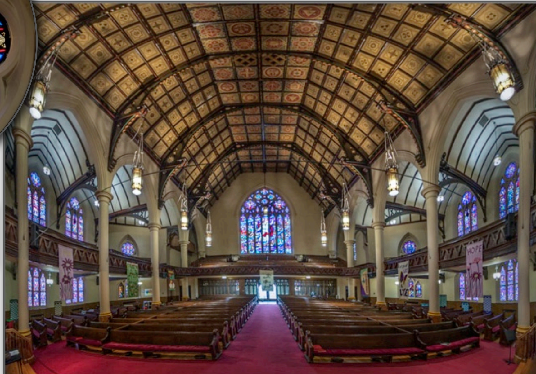
View from pulpit looking out into the church sanctuary. (left).

Central United Methodist Church’s roots date back to 1804 and has long been known as a “Peace and Justice” church. As part of it’s social justice identity, it has hosted sermons by Rev. Jesse Jackson, Sr. and Rev. Dr. Martin Luther King Jr. The church co-sponsors NOAH and its work with the homeless.