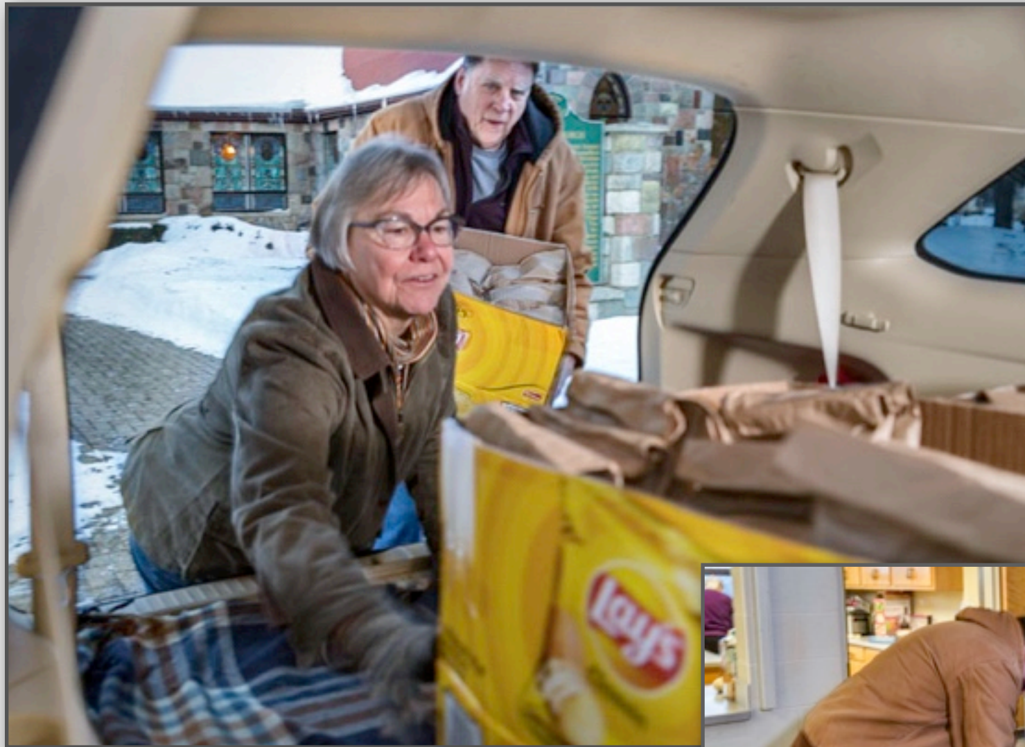
At this time, cartons of bagged lunches are loaded into waiting vehicles. (left)