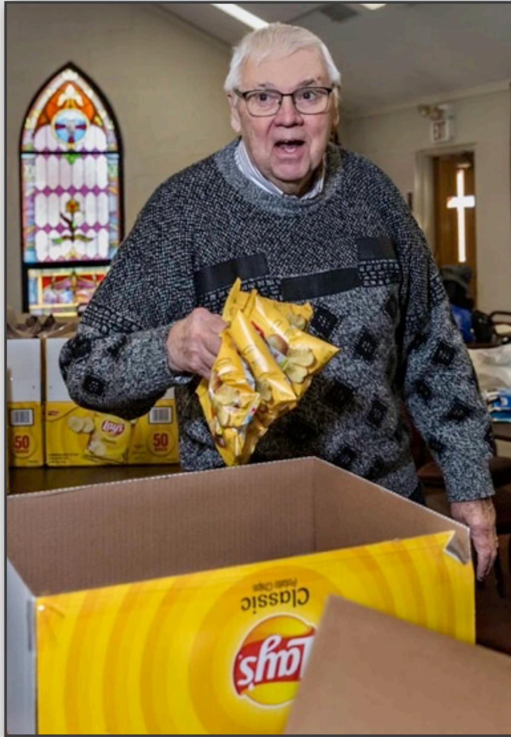
Bags of potato chips are removed from cartons and the empty boxes are recycled to hold completed bag lunches awaiting transport to NOAH in Detroit.