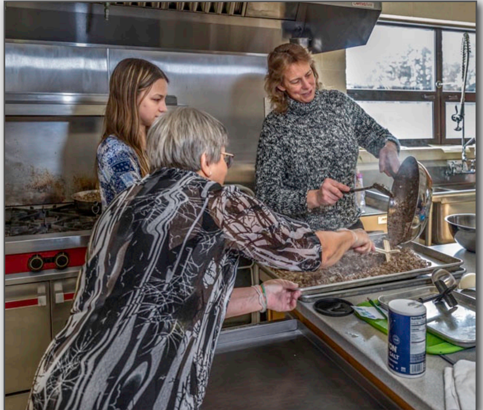
After cooking, the meat mixture is placed on baking sheets and refrigerated until the morning of food delivery. (below)

This process of meat preparation extended over both Sunday and Monday for Tuesday's delivery.