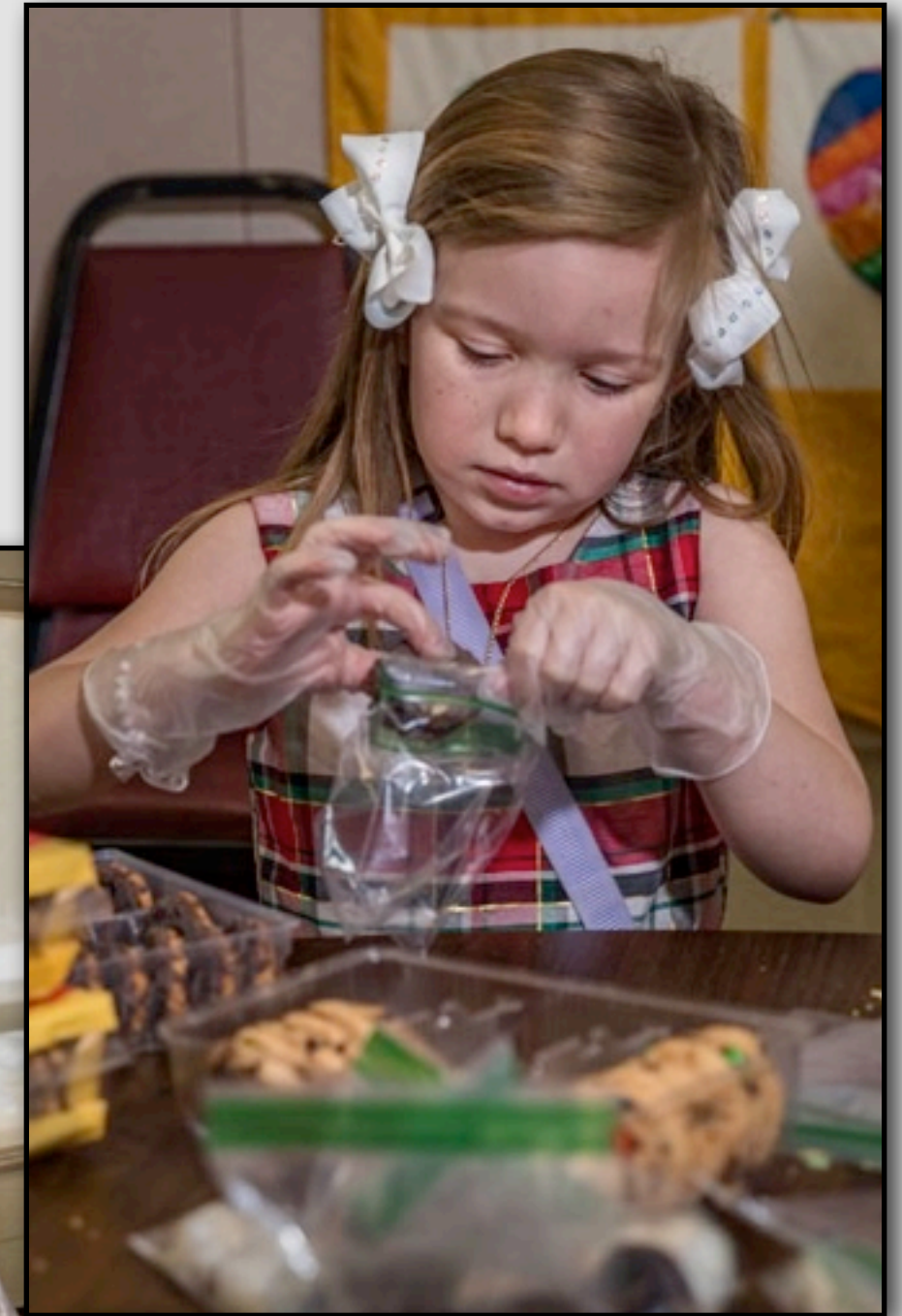
Adults and children pitch in to bag cookies for each individual lunch. (center and right)