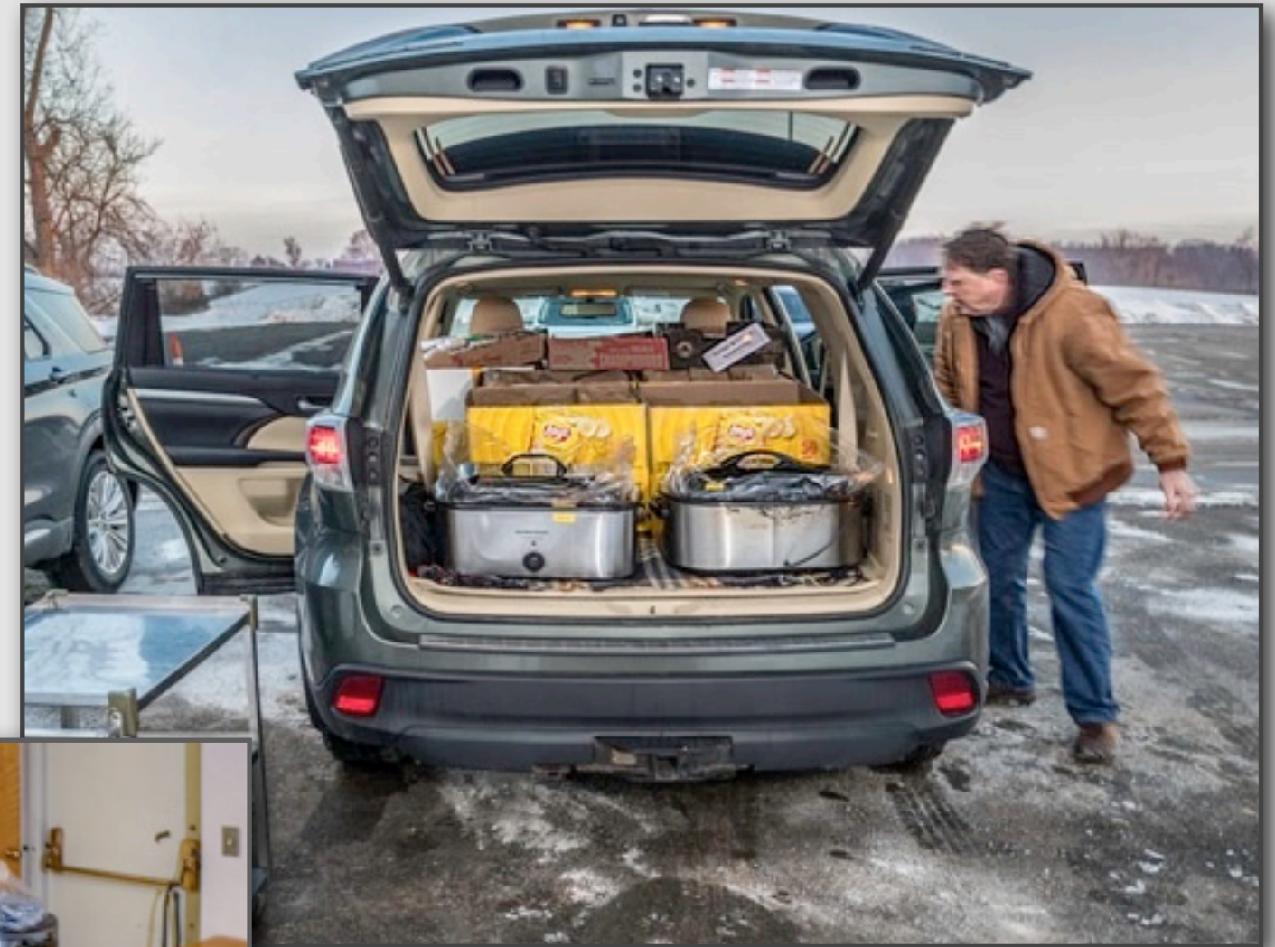
Finally, the load is topped off with sandwiches, clothing and other donations. (right)