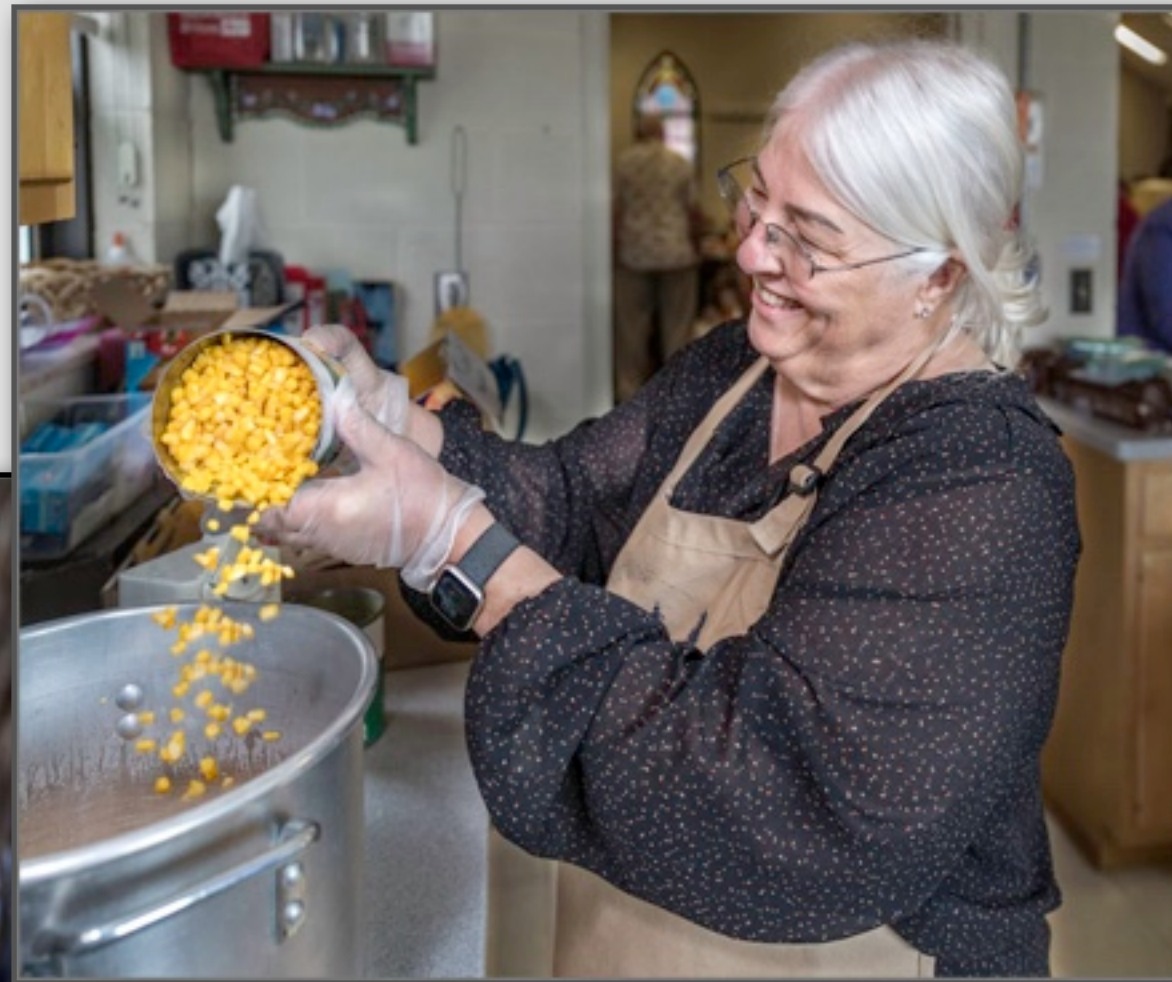
A celebration is in order after opening the last of many cans of tomatoes, sauce and vegetables used in today's hot food preparation.