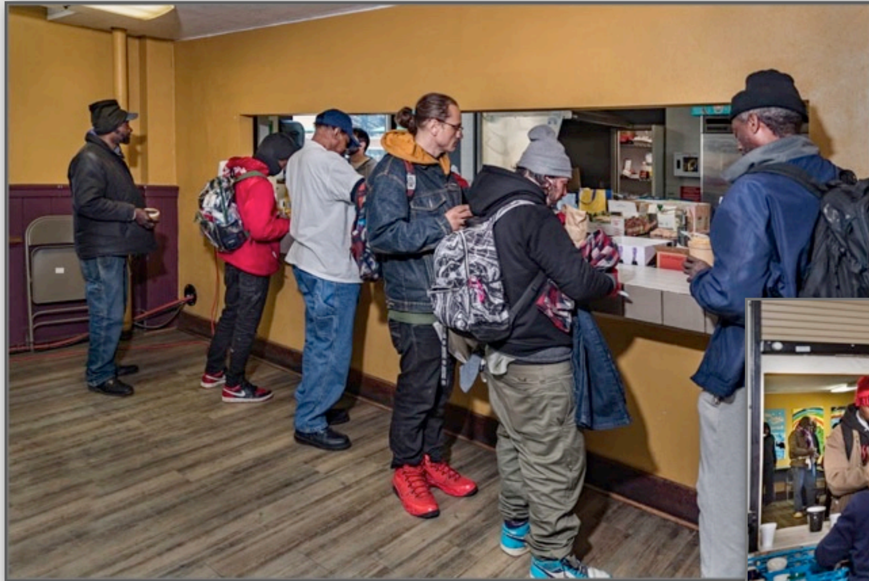
People are served quickly and courteously. Everyone is given a choice of what items he/she would prefer. (left)