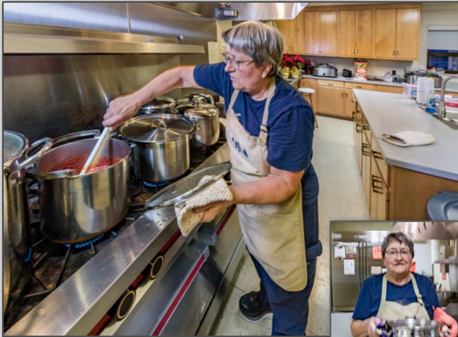
Early in the morning of food delivery day, pots of refrigerated chili sauce are heated to serving temperature. (above)