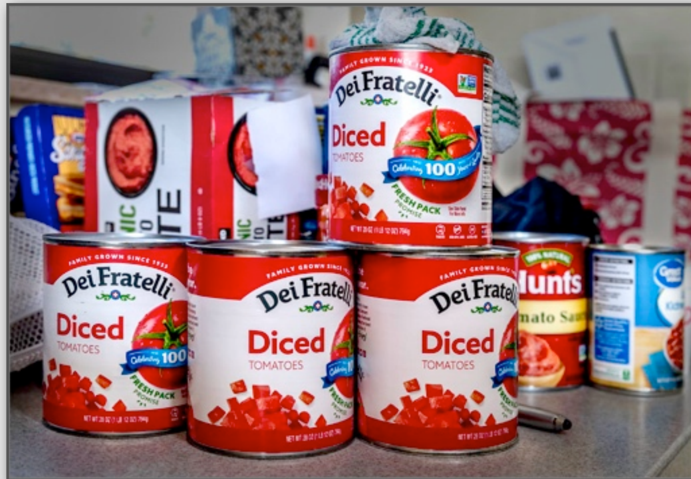
300 servings of chili and soup requires plenty of tomatoes.

Because the weather has been cold, church members decided to include hot chili as part of their February food offering. Hot soup was included in Bethel's April offering.