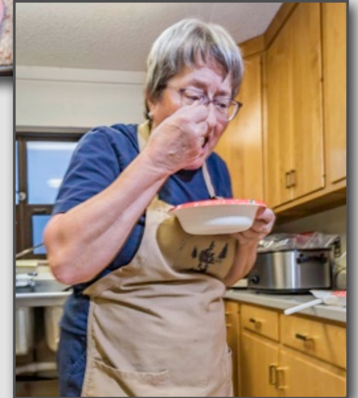
Finally, a tasting confirms that the chili is "good to go". (right)