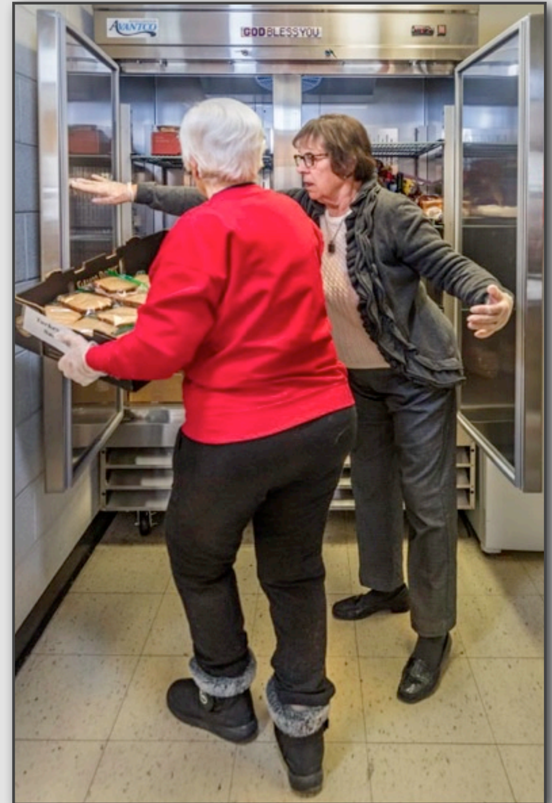
All lunches and perishable ingredients are kept under refrigeration until it is time for loading into volunteers' cars for transport to Detroit. (right)