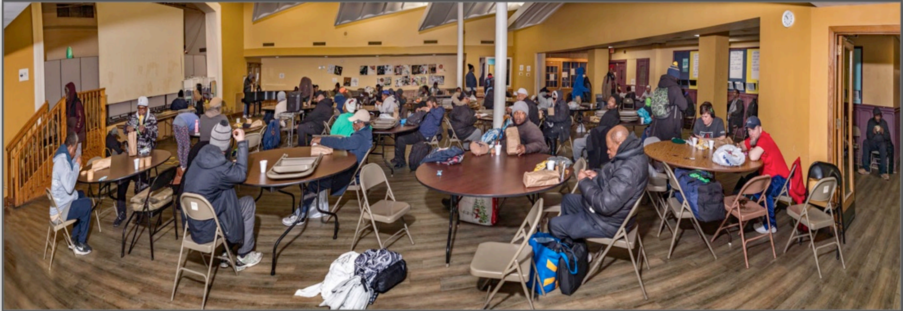
Community members relax and enjoy today's lunch in the fellowship hall. Bethel's work is done...for today.