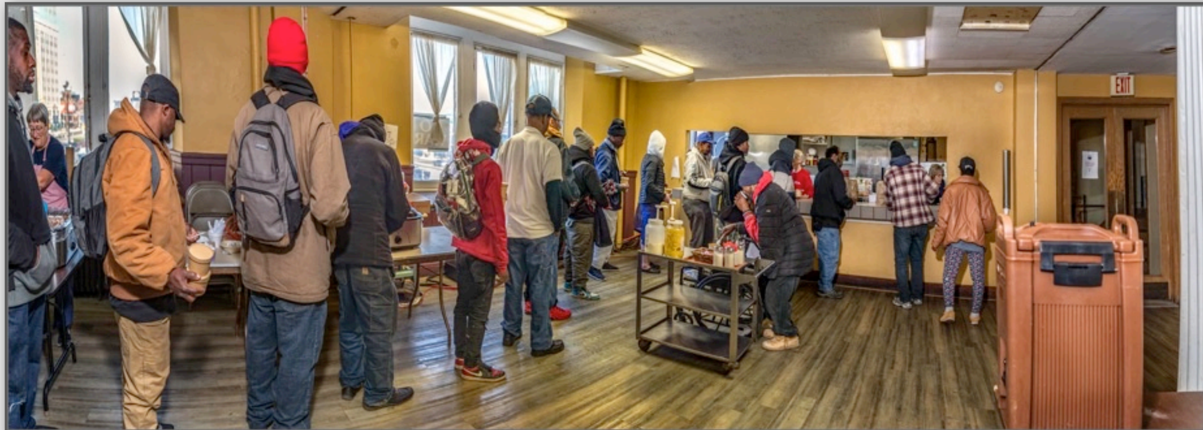
At 10:30 am, everyone lines up, signs in and lunch service begins. (above and left)