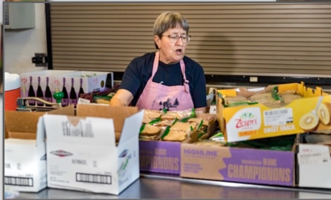
Sandwiches are laid out and made ready for easy selection. (left and below)