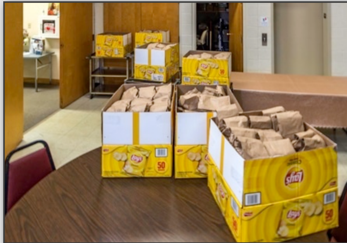
View showing completed bag lunches packed in boxes ready for transport to NOAH. (above and left)