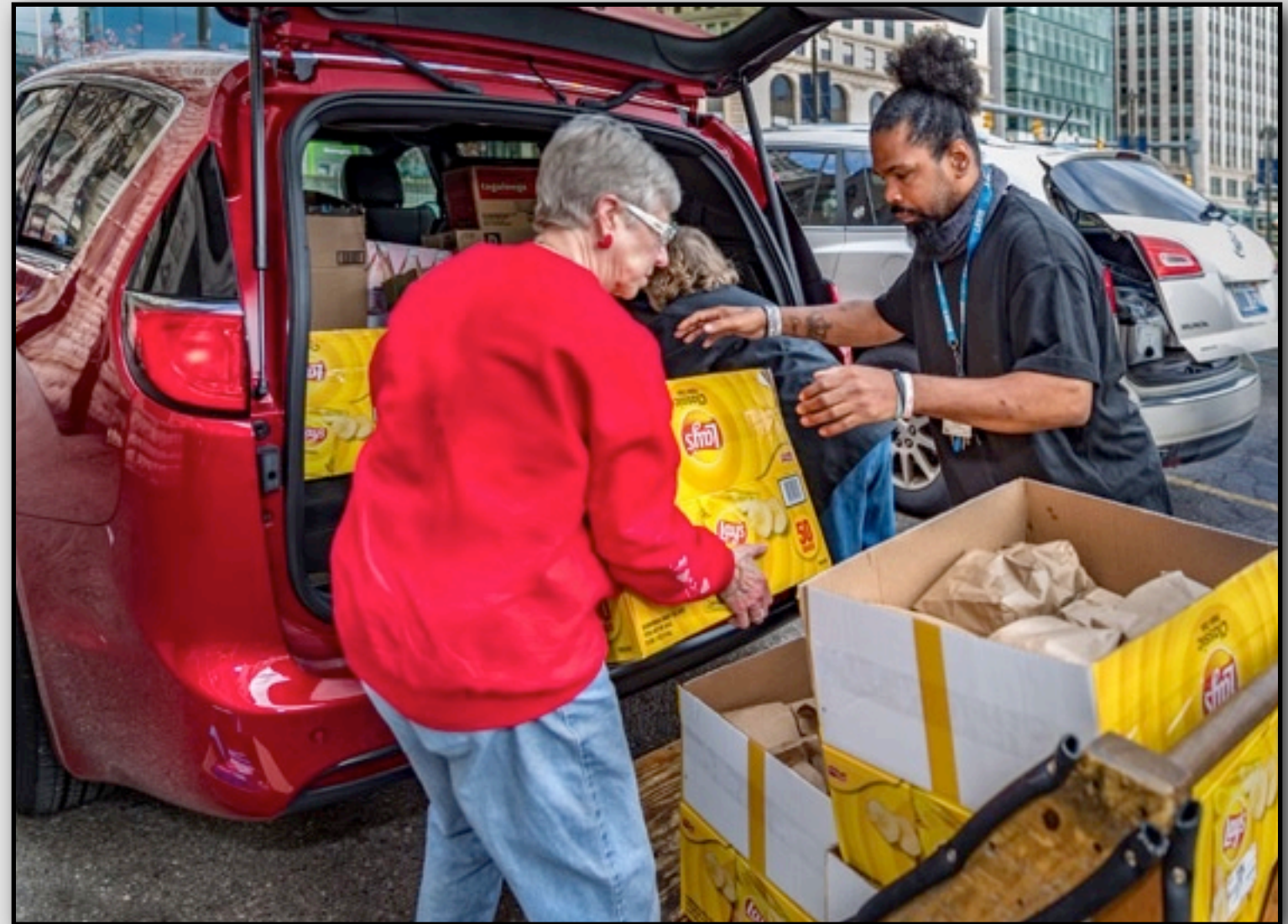
Here, the Bethel volunteers arrive at the church parking lot and prepare to unload. A NOAH staff member helps move the food and other donations onto carts for transportation upstairs to the second floor. (left and above)