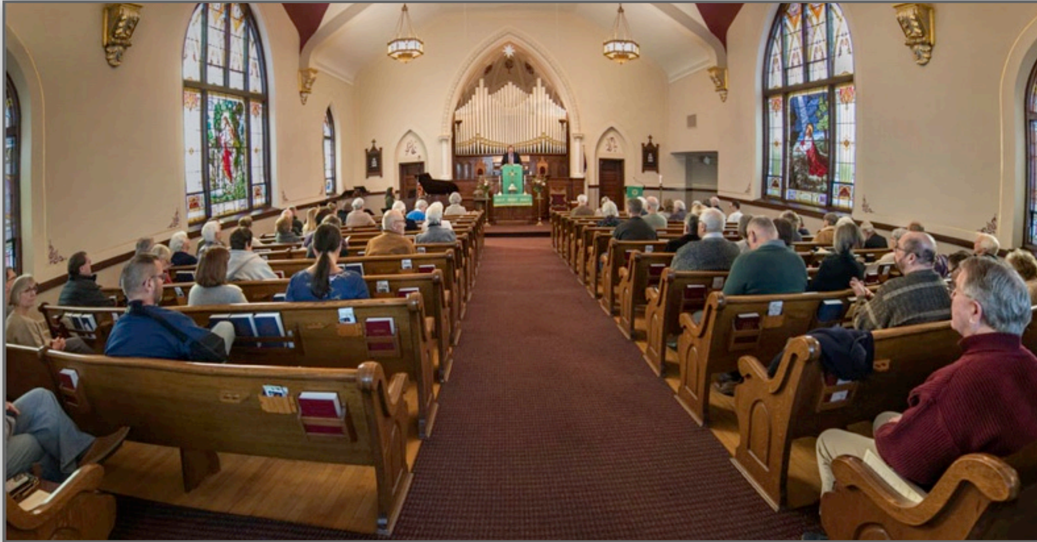
A typical Sunday service in Bethel's sanctuary. The current field stone church was completed in 1909. The original log church was erected in 1840 and replaced by a wood frame building in 1857.

Sometimes seemingly small actions can have a far reaching effect, much like that of a stone dropped into a still pond. For example, the NOAH Project in Detroit provides food and social services to homeless people and partners with churches, organizations and individuals for assistance. NOAH stands for N etworking O rganization A dvocating for the H omeless. Bethel United Church of Christ is one of about two dozen southeast Michigan churches that support NOAH in its mission of providing lunches to the homeless.