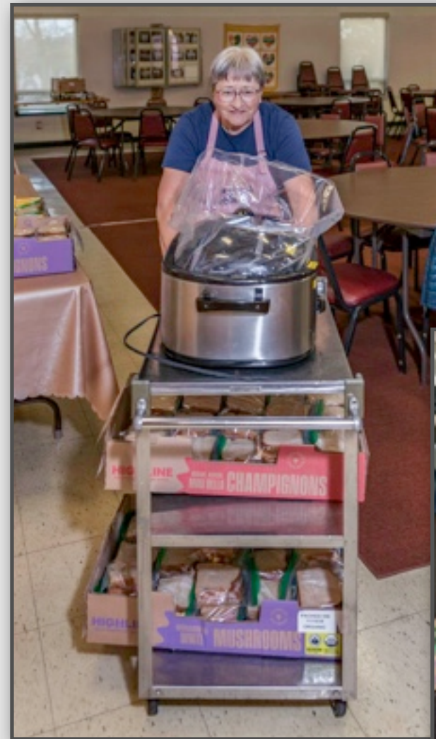
Roasters are then loaded onto carts and placed into vehicles after cold food items have been loaded. (left and below)