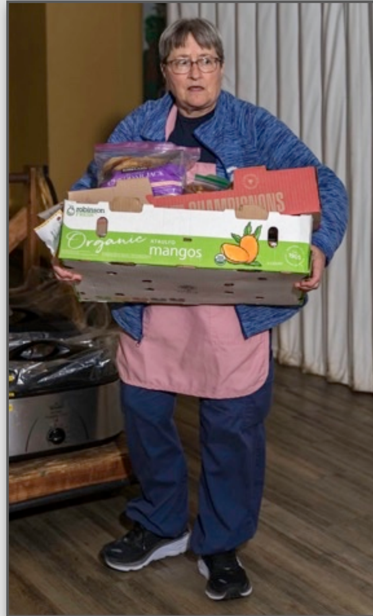
The food must be unpacked and made ready for distribution. (below and right)