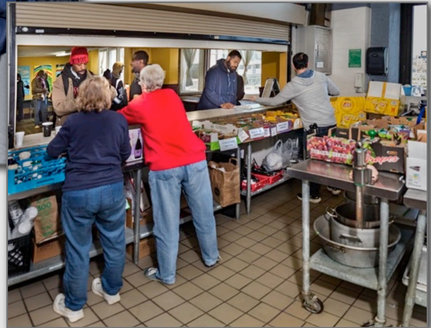
300 lunches including sandwiches are available. About half will be served here. The remainder will be shared with shelters and community outreach volunteers bringing food to the people. (right)