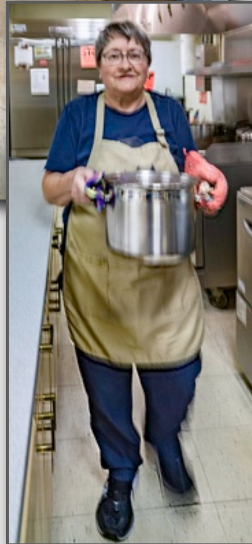
Simultaneously, the refrigerated meat mixture is placed into large roasters and brought up to temperature. (right)