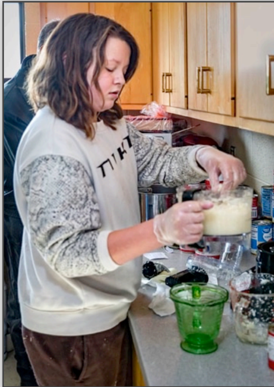
Chopped onions are then diced in a food processor causing more “onion eyes”. (left and center)