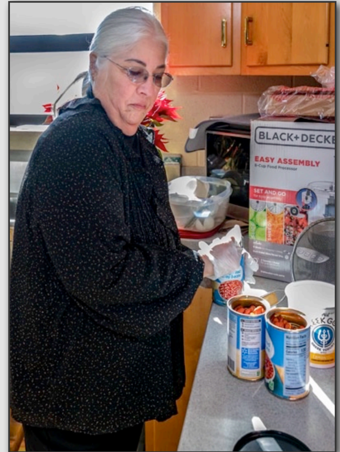
Beans and other vegetables are important ingredients in soups and chili. (right)