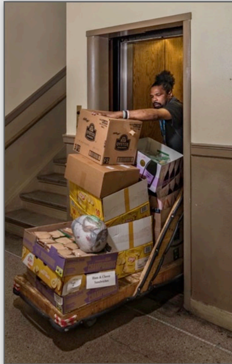
Multiple cart-loads are taken by elevator to NOAH's kitchen. (above)