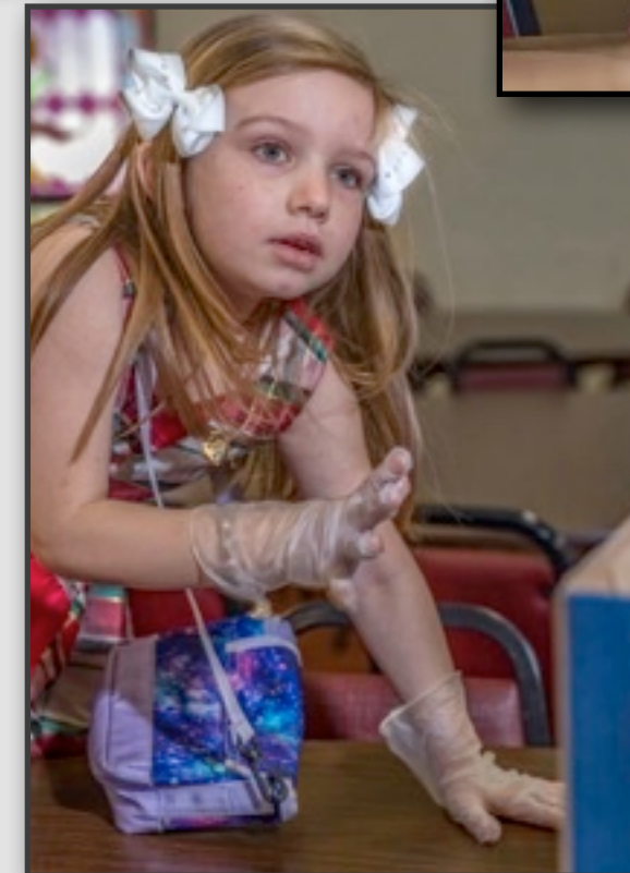
Children help in the assembly process leaving other food prep for adults.