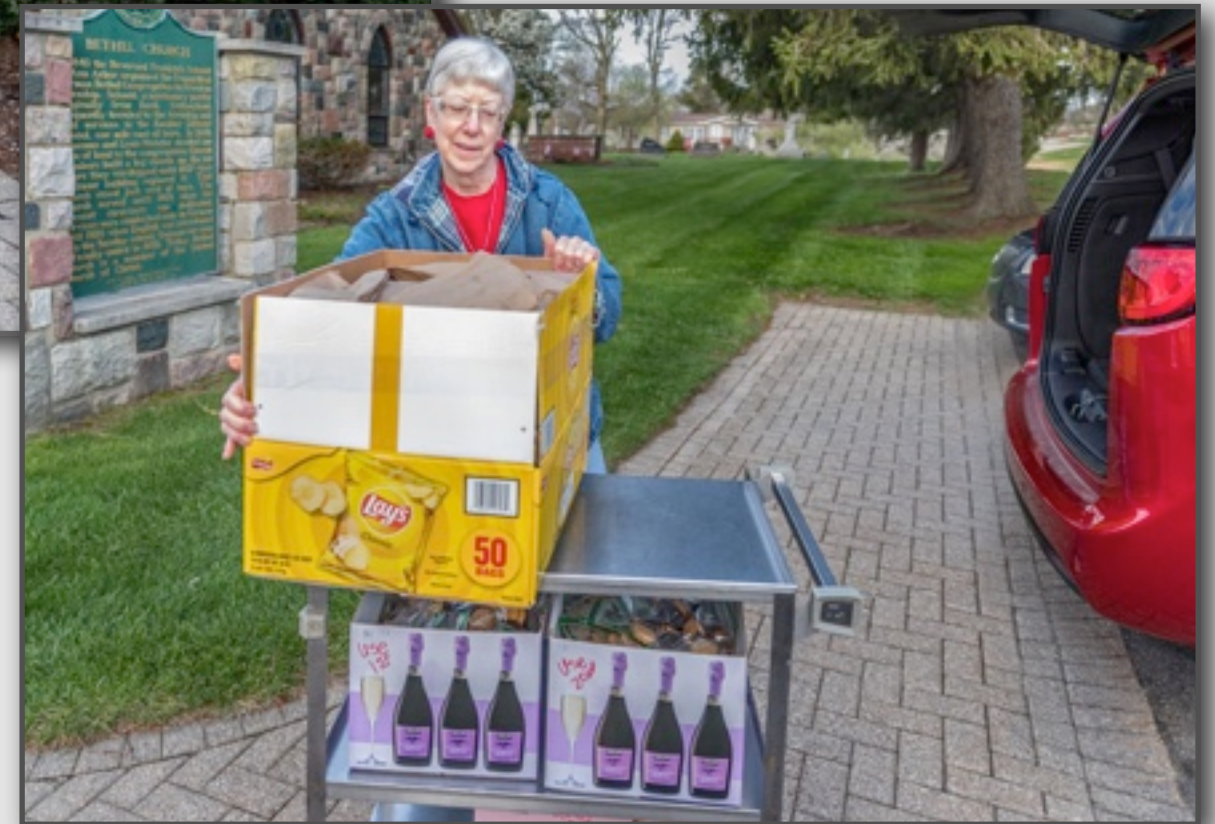
On food delivery day, the soup process is similar to that of hot chili. Bag lunches and other cold foods are loaded onto carts and placed into waiting vehicles first. (3 photos)