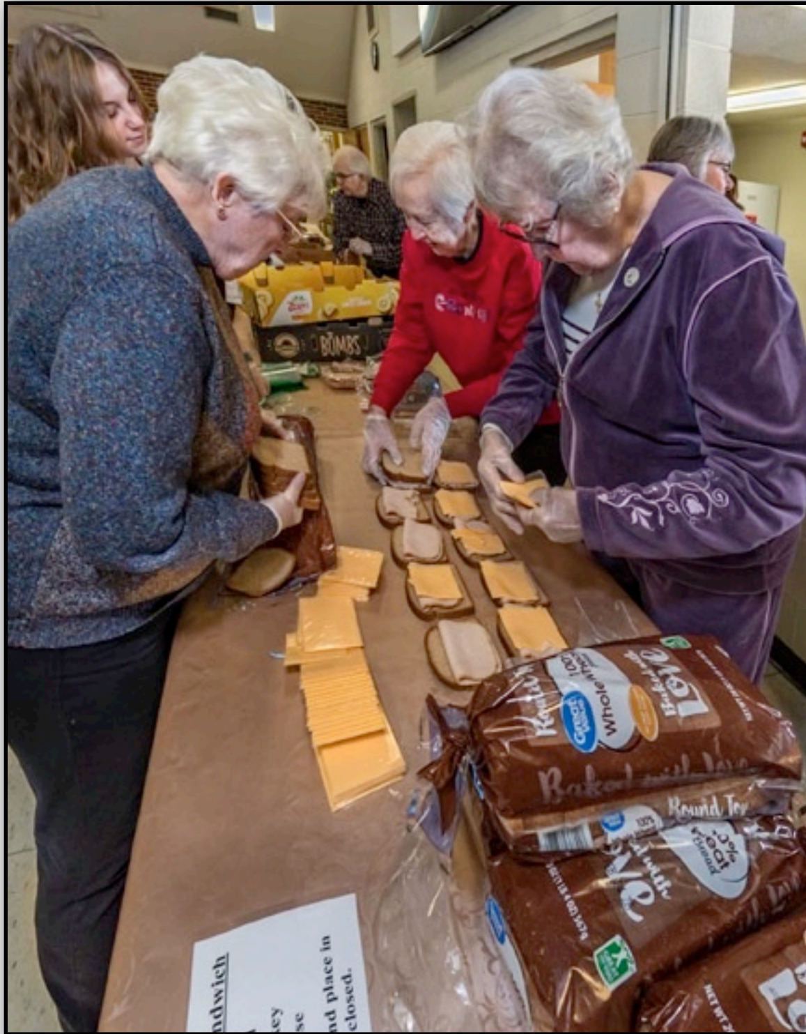
Everyone lends a hand making sandwiches. (above)