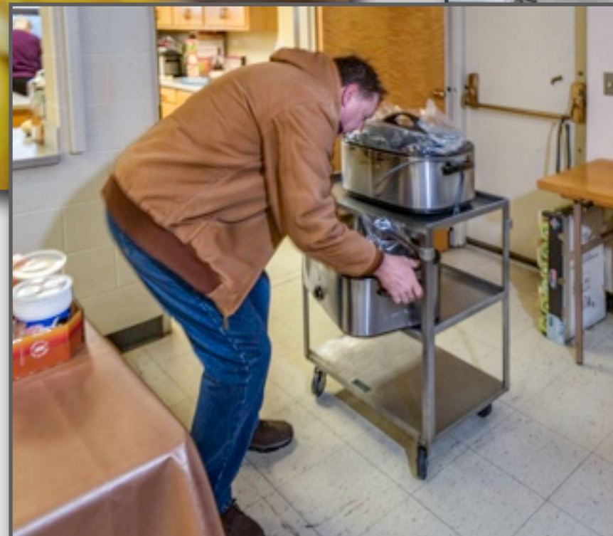
After the lunches, hot roasters of chili are loaded next. (center)