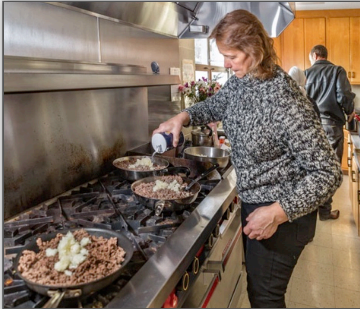
While work proceeds on the sauce, fresh and frozen ground meat is seasoned and cooked with diced onions in batches. (above)

This process of meat preparation extended over both Sunday and Monday for Tuesday's delivery.