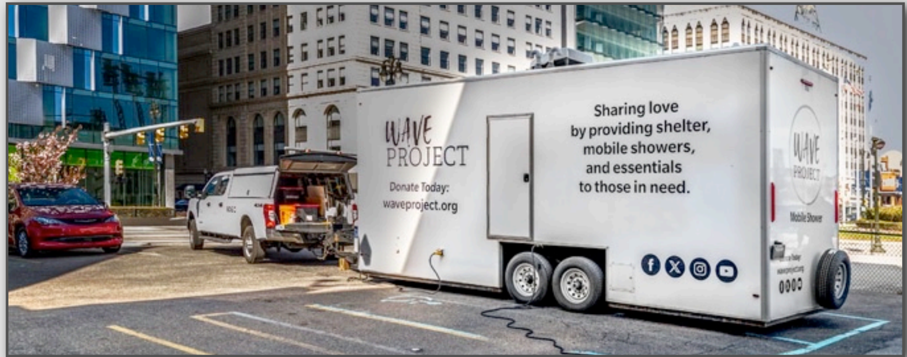
NOAH supports health and wellness initiatives. Pictured above is a mobile shower trailer that frequents the organization's location. Wayne County also provides mobile health and dental services for the homeless.