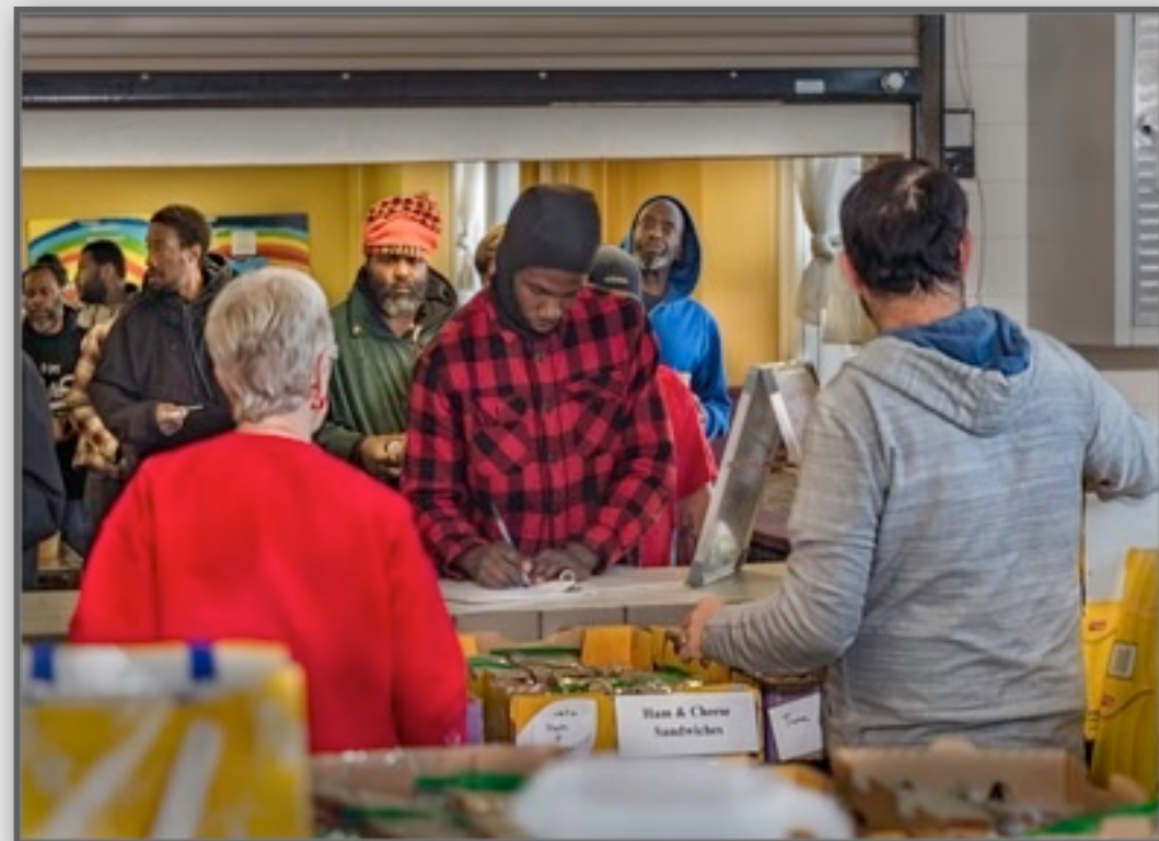
Today hot soup is on the menu along with the regular items. (right)