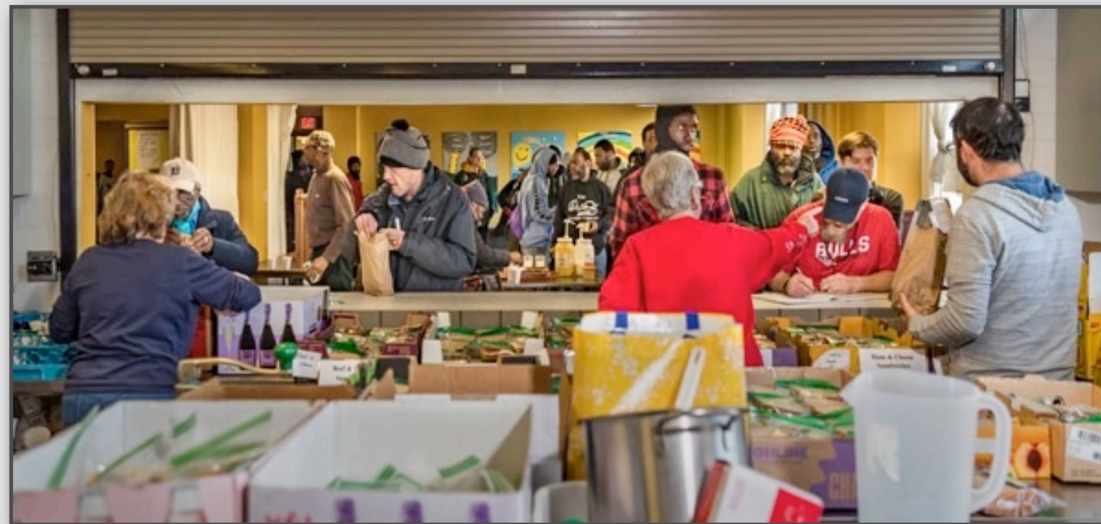
Four days a week, NOAH provides bag lunches to the needy. Bethel Church has partnered for today's meal. (left)