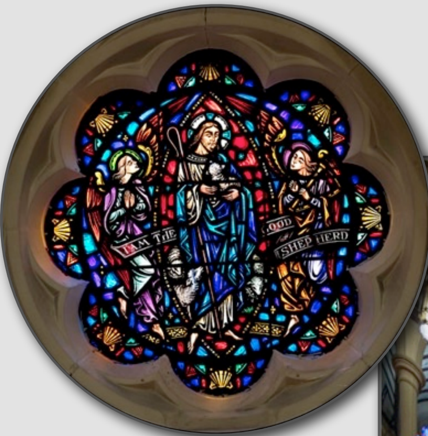
Stained glass “I am the good shepherd” window in the Central United Methodist Church sanctuary.